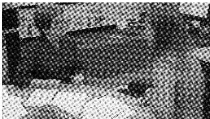
A teachers debriefs with a literacy coach at Naquag.