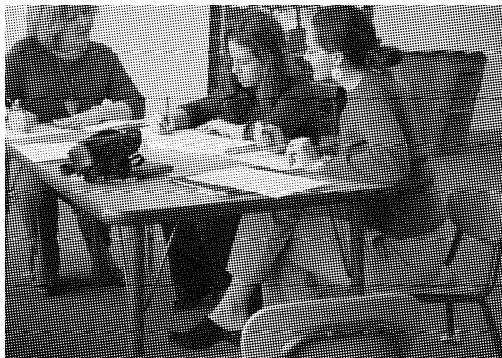
An afterschool Professional Learning Community at Glenwood collaboratively plans instruction.